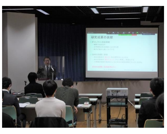
Fig. 4: Invited Talk 1 (1).