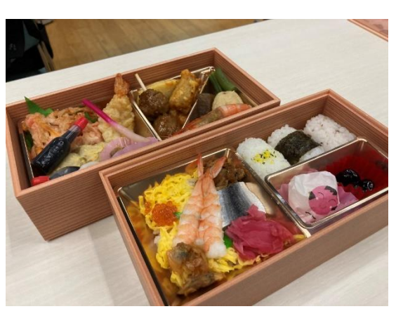
Fig. 8: Lunch.