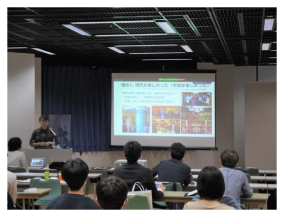
Fig. 9: Invited Talk 2 (1).