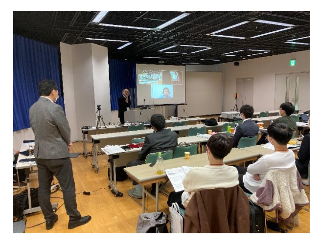
Fig 3: Free discussion.