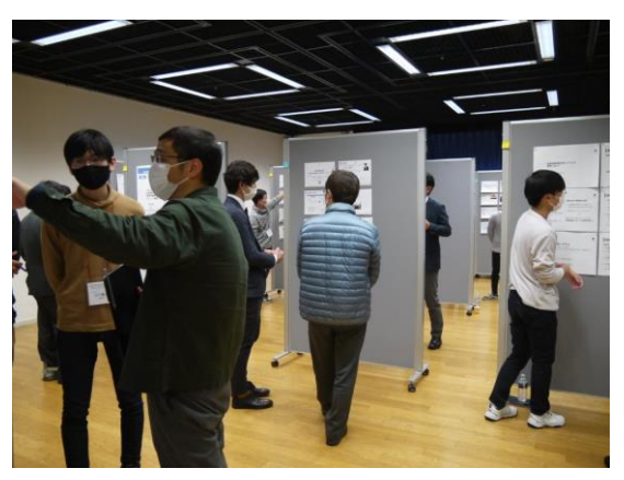
Fig. 10: Poster Presentation.