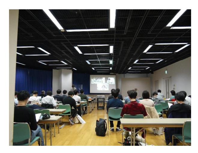
Fig 1: View of the event.