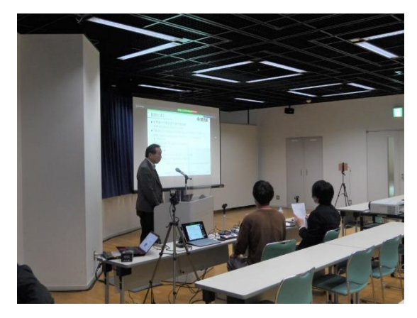
Fig. 3: Introduction of IEEE CASS JJC.

During the lunch break, we enjoyed lunch in the hall while taking measures against infectious diseases (Fig. 8).