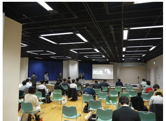
Fig. 1: Reception.