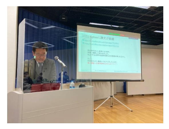
Fig. 5: Invited Talk 1 (2).