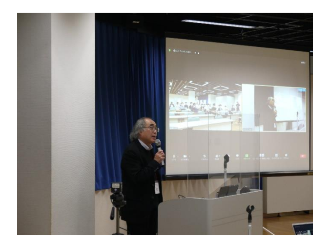
Fig 2: Invited Speaker (Prof. Kimio Ito).