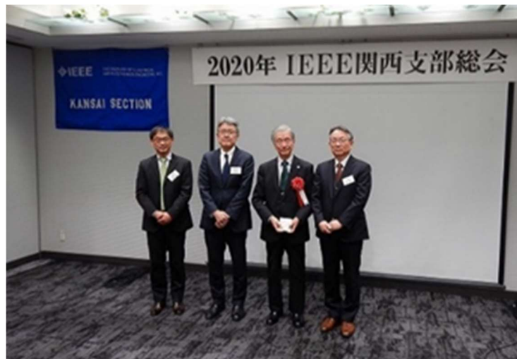
Ceremony for 2020 Contributor Award