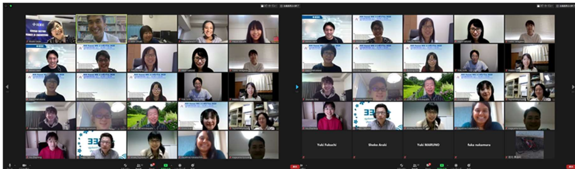
WIE Symposium 2020