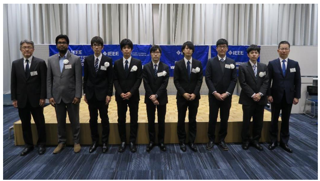
Student Paper Awards