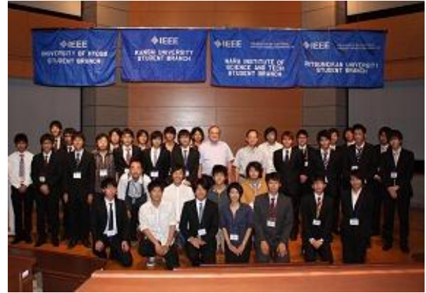
Photo 3. Left: a photo taken after the inaugural meeting of Doshisha University student branch in April, 2013, Right: annual English Presentation Competition at Ritsumeikan University in October 2013