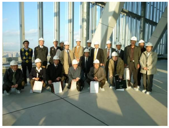
Photo 6. Left: Kokei no niwa (Tiger glen garden) in Nishi Honganji temple, Right: Abeno HARUKASU building, which was under construction