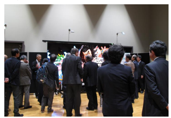
Technical tour at Science and Technology Research Laboratories, NHK

After above lectures, participants experienced 8K Super Hi-vision with very large screen full of force in the auditorium. Then they observed the 8K living theater, a video comparison between, 60Hz and 120Hz framerate, an 8K sheet type display, and an integral 3D vision.