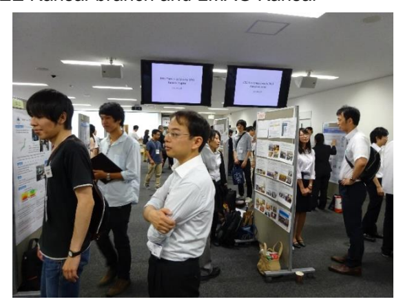
Poster session scenery

In the afternoon, there was POSTER SESSION where they made many research reports and also activity introductions of Affinity Groups in poster presentations. We both tried to collect much information, and met and talked with the officers of IEEE Kansai-branch and LMAG Kansai