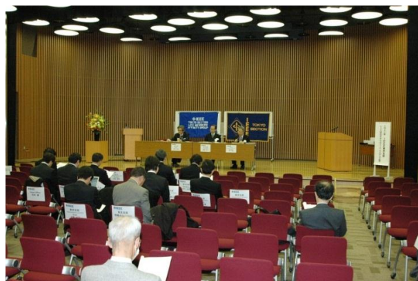
Attendees on the General Assembly: 22 persons

The first Tokyo Chapter LMAG Lecture of this year was held on Monday, April 9, from 4:00 at