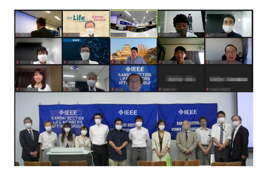
EA event "Learn cutting-edge-technologies in English"