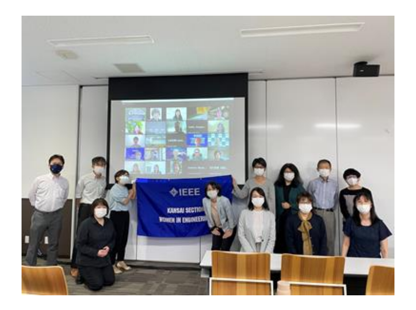
WIE Symposium 2021