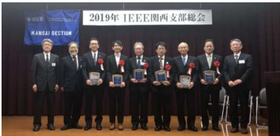
Supporting Friend Awards