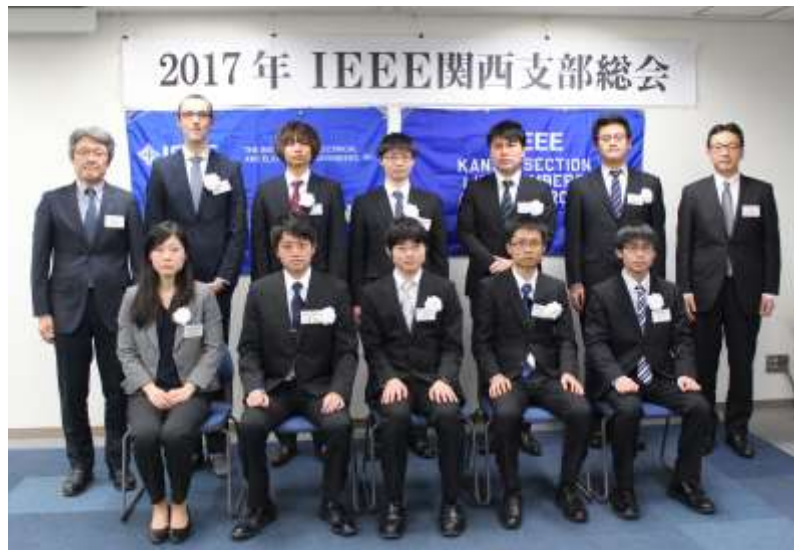
Student Paper Awards