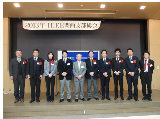
Photo 1. IEEE Kansai Section Medal recipients

The IEEE Kansai Section Medal is presented to new Senior Members. The medal is designed with a portrait of Gennai Hiraga, who was a multi-talented person, especially known as writer and inventor in Edo era, and assembled Japan's first electrostatic generator (called Elekiter), which used the power of friction to generate electricity. We presented the medals to eleven new Senior Members at the annual section meeting on February 12, 2013.