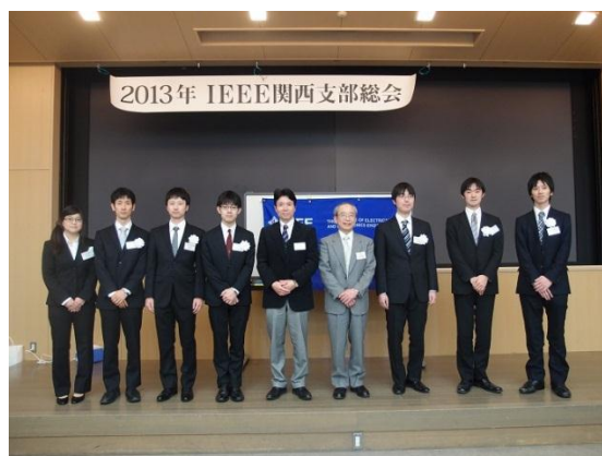
Photo 3. IEEE Kansai Section Student Paper Award

In 2004, we also established a new award for students, the Kansai Section Student Paper Award. This award is for student members who present their research results at IEEE international conferences or in IEEE Transactions. We selected 7 winners of this award in 2012.