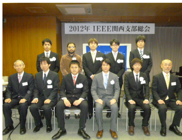
Photo 3. IEEE Kansai Section Student Paper Award

In 2004, we also established a new award for students, the Kansai Section Student Paper Award. This award is for student members who present their research results at an IEEE international conference or in IEEE Transactions. We selected 12 winners of this award in 2011.