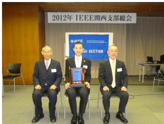
Photo 2. IEEE Kansai Section GOLD Awards

In 2004, we also established a new award for students, the Kansai Section Student Paper Award. This award is for student members who present their research results at an IEEE international conference or in IEEE Transactions. We selected 12 winners of this award in 2011.