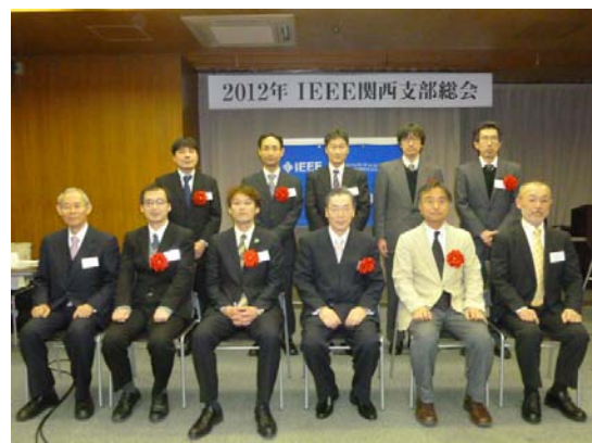
Photo 1. IEEE Kansai Section Medal winners

The IEEE Kansai Section Medal is presented to new Senior Members. The medal is designed with a portrait of Gennai Hiraga, who constructed the first friction generator in Japan, called Elekiter. We presented the medals to 12 new Senior Members at the annual section meeting on February 14, 2012.