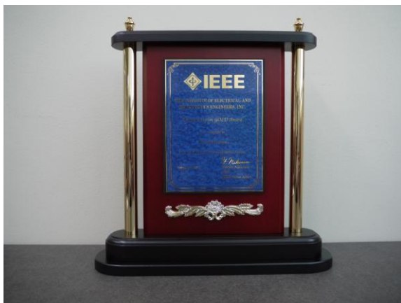
Photo 2 IEEE Kansai Section GOLD Award