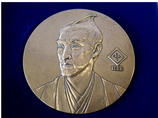
Photo 1 IEEE Kansai Section Medal

For that purpose, Kansai Section gives "the IEEE Kansai Section Medal" to a new Senior Member and supports an application for Senior Member grade on our web site.