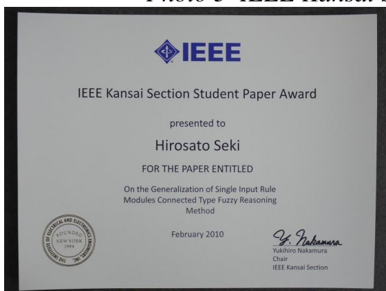
Photo 3 IEEE Kansai Section Student Paper Award

In 2004, we also established a new award for students, the Kansai Section Student Paper Award. This Award is for student members who have presented their excellent research results in IEEE international conference or IEEE Transactions. We selected 11 winners of this award in 2009.