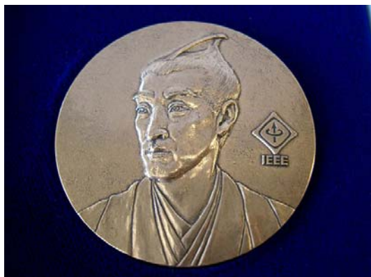
Photo 1 IEEE Kansai Section Medal

For that purpose, Kansai Section gives "the IEEE Kansai Section Medal" to new Senior Member and support an application for Senior Member grade on our web site.