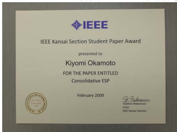
Photo 3 IEEE Kansai Section Student Paper Award

In 2004, we also established a new award for students, the Kansai Section Student Paper Award. This Award is for student members who have presented their excellent research results in IEEE international conference or IEEE Transactions. We selected 12 winners of this award in 2008.