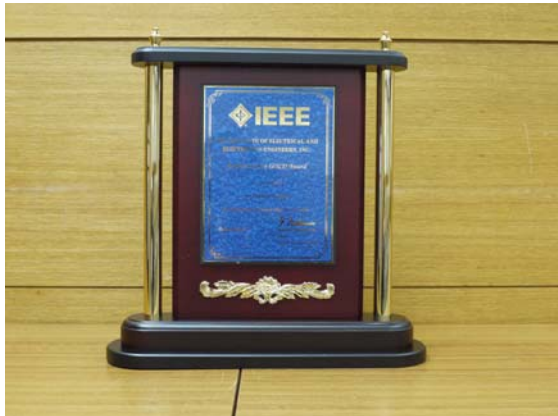
Photo 2 IEEE Kansai Section GOLD Award