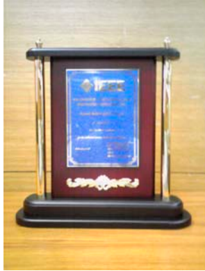
Photo 2 IEEE Kansai Section GOLD Award