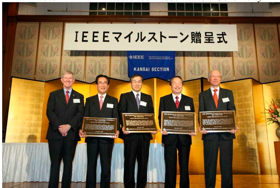
Photo 4 IEEE Milestones Presentation Ceremony