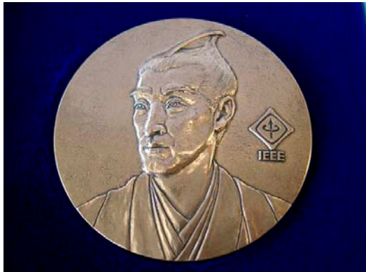
Photo 1 IEEE Kansai Section Medal