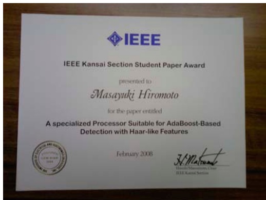
Photo 3 IEEE Kansai Section Student Paper Award

In 2004, we also established a new award for students, the Kansai Section Student Paper Award. This Award is for student members who have presented their excellent research results in IEEE international conference or IEEE Transactions. We selected 13 winners of this award in 2007.