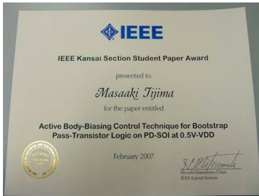
Photo 3 IEEE Kansai Section Student Paper Award

In 2004, we also established a new award for students, the Kansai Section Student Paper Award. This Award is for student members who have presented their excellent research results in IEEE international conference or IEEE Transactions. We selected 10 winners of this award in 2006.