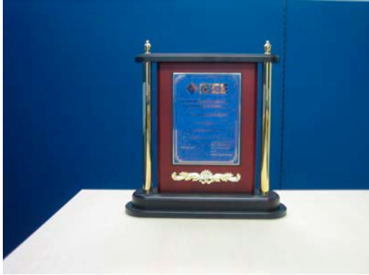
Photo 2 IEEE Kansai Section GOLD Award