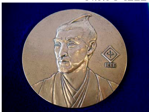
Photo 1 IEEE Kansai Section Medal